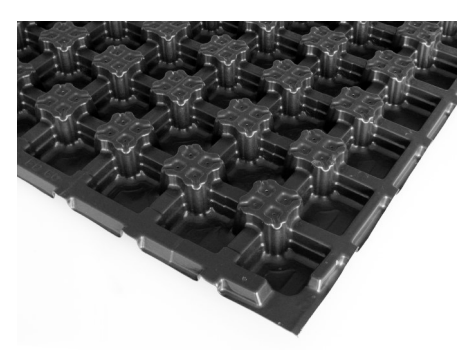
Highly efficient drainage and water storage element made of profiled plastic, suitable for intensive green roofs.